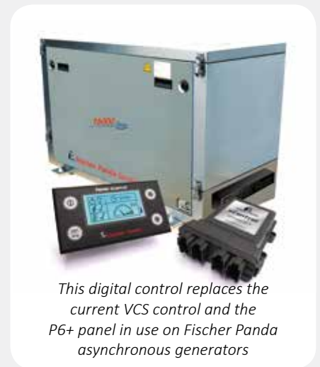
This digital control replaces the current VCS control and the P6+ panel in use on Fischer Panda asynchronous generators